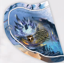
REALM FOR 2 PLAYERS