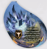
UTGARD REALM TOKEN