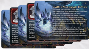
5 CONTROL CARDS