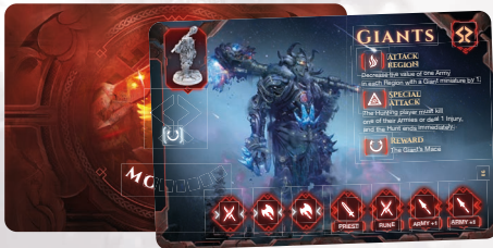
FROST GIANTS MONSTER TRAY