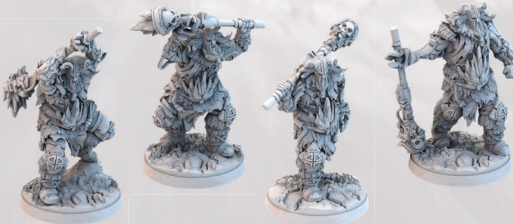
4 FROST GIANT MINIATURES