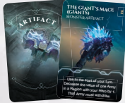
FROST GIANTS MONSTER ARTIFACT